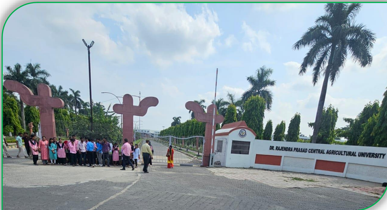
Main Entrance gate of Dr. Rajendra Prasad Central Agricultural University, Pusa on dated 17.04.2023

Guide of these guided and told about the special Character of the rare species of plants. Inside these lots of beautiful flowers was also found. Specially, Rose garden was so much exciting so many colors of beautiful roses are available there. They feel very happy to saw this.