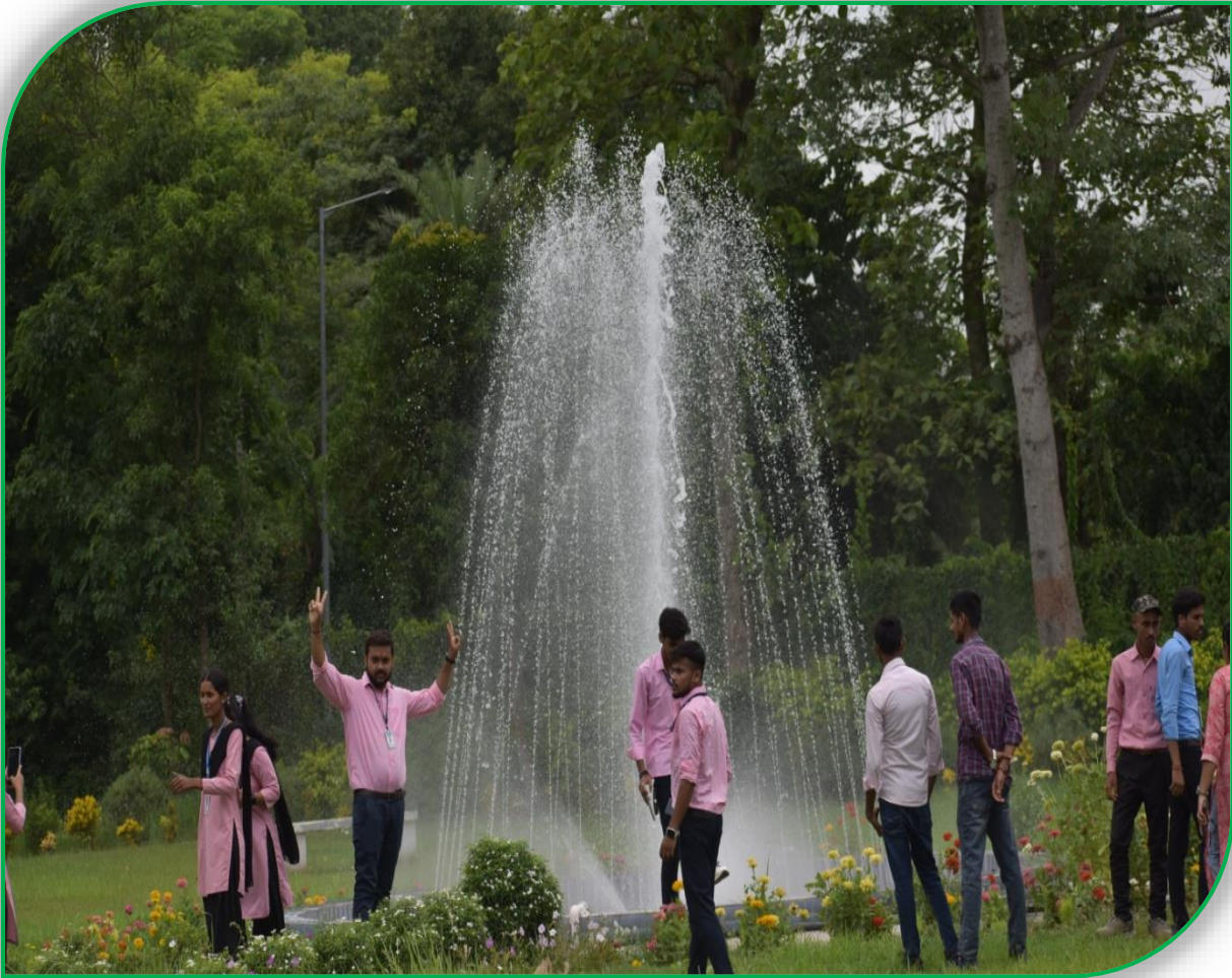
Students visiting Sugarcane Research Institute Pusa on dated 17.04.2023

At last they have visited main building of this University where Vice-chancellor and all officials of the University is sitting. It looks very attractive and well maintained.