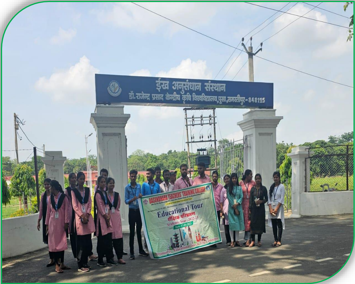
Students visiting Sugarcane Research Institute Pusa on dated 17.04.2023

In the field of University they have seen different species & varieties of mangoes, which they have developed.