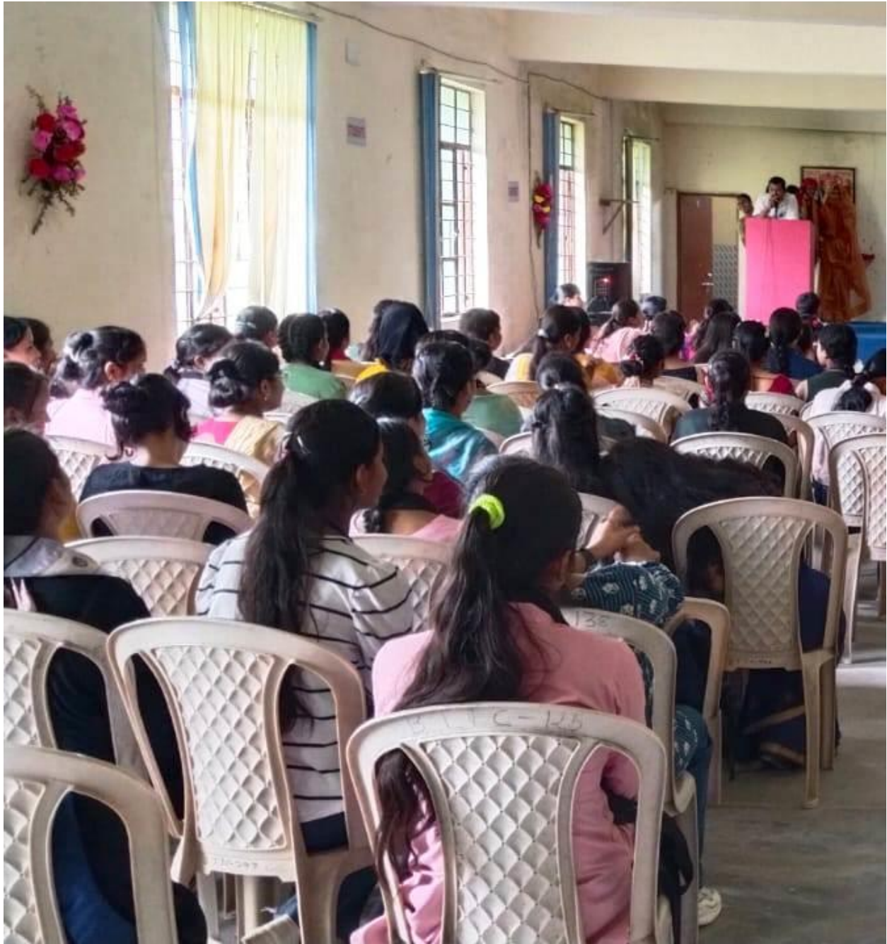
Course Coordinator Giving Brief Description of the Objective of the course