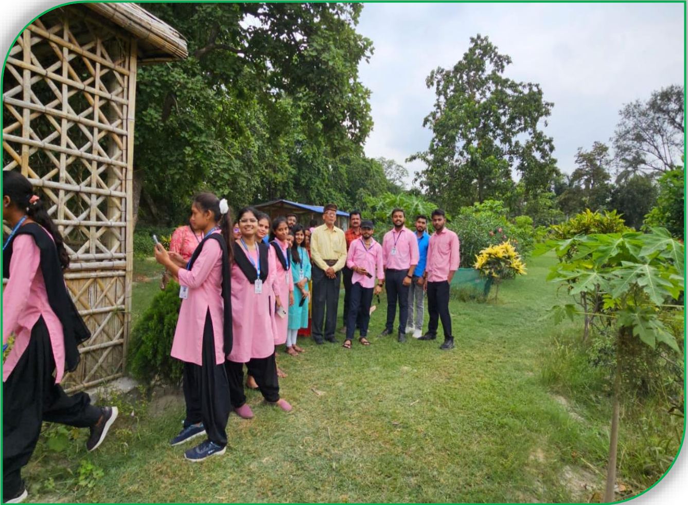
Students getting information about Mushroom harvesting at University campus Pusa on dated 17.04.2023

After that they went to visit the Dr. S. N. Sinha Library . There were a big library where more than thousand of books found. All books are very useful in the field of agriculture and all of different writer and publication.