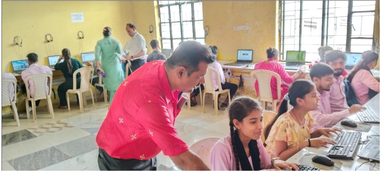
Practical Session of Student

This course commence from dated- 17.12.2022 to 16.02.2023. After the completion of course skill development committee has taken multiple objectives type examination in the examination all' students who enrolled has appeared and obtained more than 70% marks.