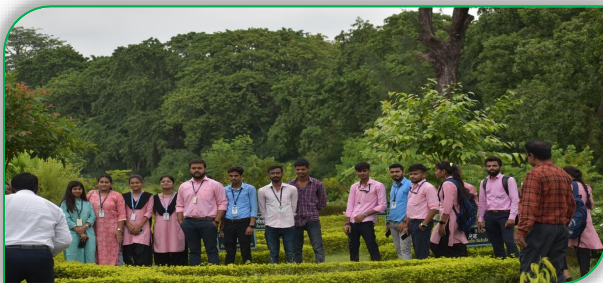
Students enjoying themselves at Botanical Garden, Pusa on dated 17.04.2023

Guide of these guided and told about the special Character of the rare species of plants. Inside these lots of beautiful flowers was also found. Specially, Rose garden was so much exciting so many colors of beautiful roses are available there. They feel very happy to saw this.