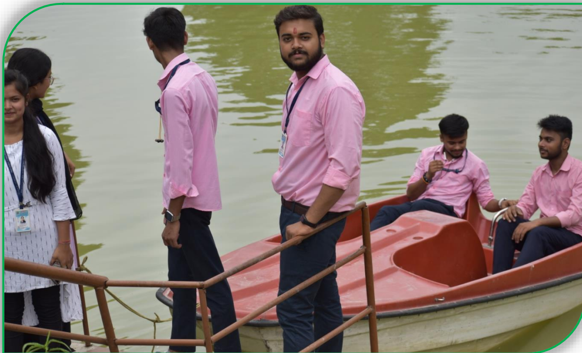
Students enjoying boating, Pusa on dated 17.04.2023

Inside this Botanical garden, there is boating facility was also available. They did boating and enjoyed a lot.